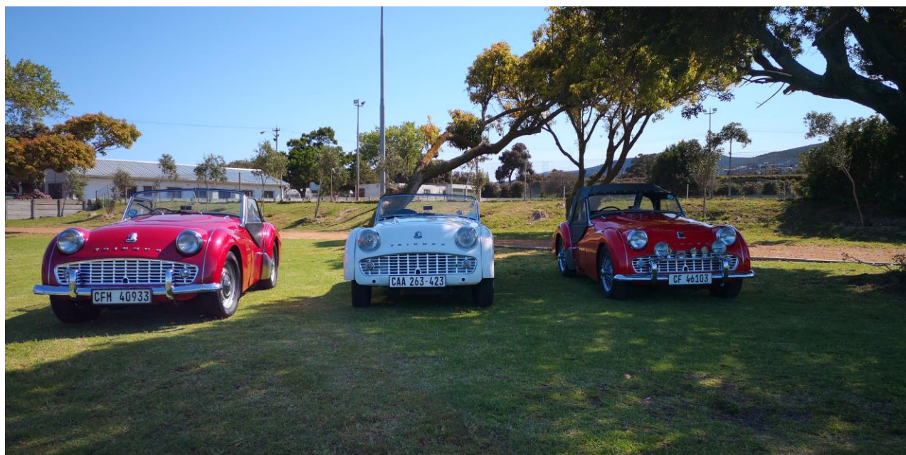
THREE LOVELY TR3AS AT THE LAST CLUB NOGGIN