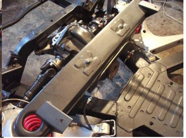
The repairs near the differential