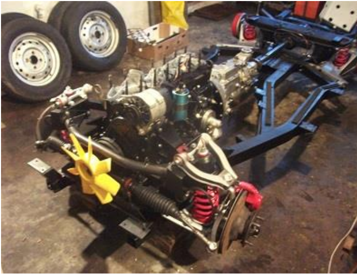
Chassis and engine