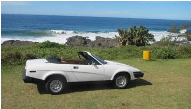
THE VORSTER TR7