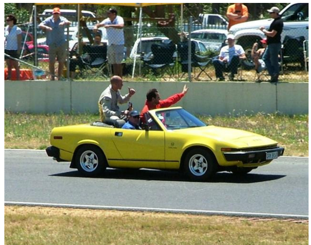
Some of the cars that took part in the Killarney lunchtime parade on 15 November 2008