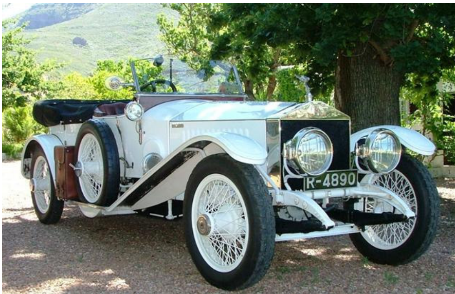
The oldest car seen at the British Sports car run in November 2008 was this grand old Rolls Royce

Spotted on the road in a bright red Spitfire was our latest recruit, one G P Vorster, looking very smooth in his shades!