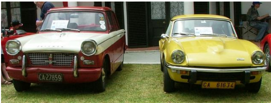
Some of the cars seen on display at Timour Hall 2008

This has been a traditional opener for the year in aid of charity. We have requested our usual spot, but this year we may have to limit some of the cars as the organisers are running out of space, such is the popularity of this event! We are going to try to get as many different types of Triumph as possible to be able to show how the Triumph marque developed over the years. I will be contacting as many of you as I can once we have had our numbers confirmed, hopefully this will be in the next week or so.