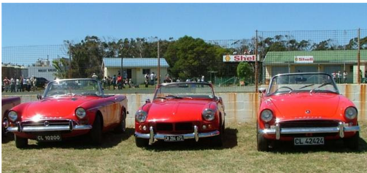
Spitfire Sandwich as seen during the Killarney lunchtime parade on 15 November 2008

We are slowly filling in the gaps for this year's club programme, so please do not feel intimidated to come up with suggestions, and above all ACTION so that the same few do not have to do all the work and get chirped by the members that "we always do the same thing"! The ball is in your court!!