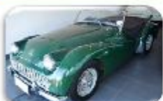
1958 Triumph TR3A

The home of the Triumphs – All models and all Colours