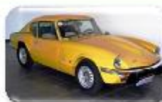
1973 Triumph GT6