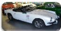
1971 Triumph Spitfire

Do you have a Triumph gathering dust in your garage that you would like to sell? Or are you looking to buy a Triumph? Give us a call and we can chat!