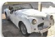
1955 Triumph TR2