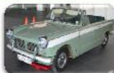
1960 Triumph Herald