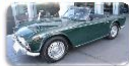
1964 Triumph TR4

Do you have a Triumph gathering dust in your garage that you would like to sell? Or are you looking to buy a Triumph? Give us a call and we can chat!