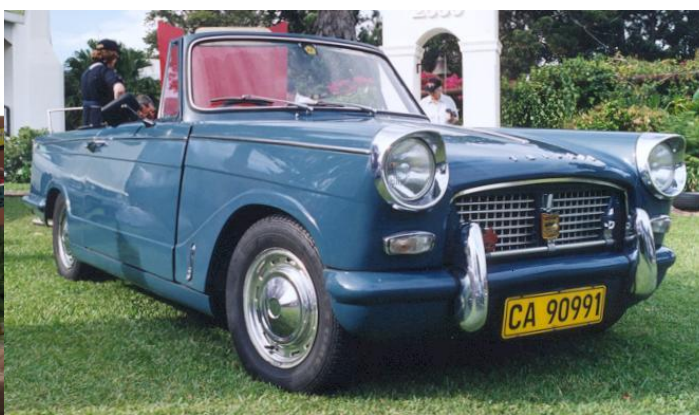
DAVE'S CAR, "BUSHPIG"